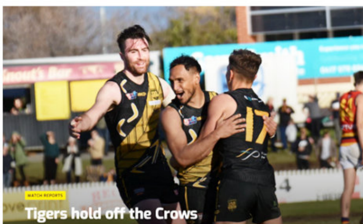
Tigers hold off the Crows

We knew the last quarter was going to be a tight one and it ended up being a high scoring quarter, with us able to have 10 shots on goal to