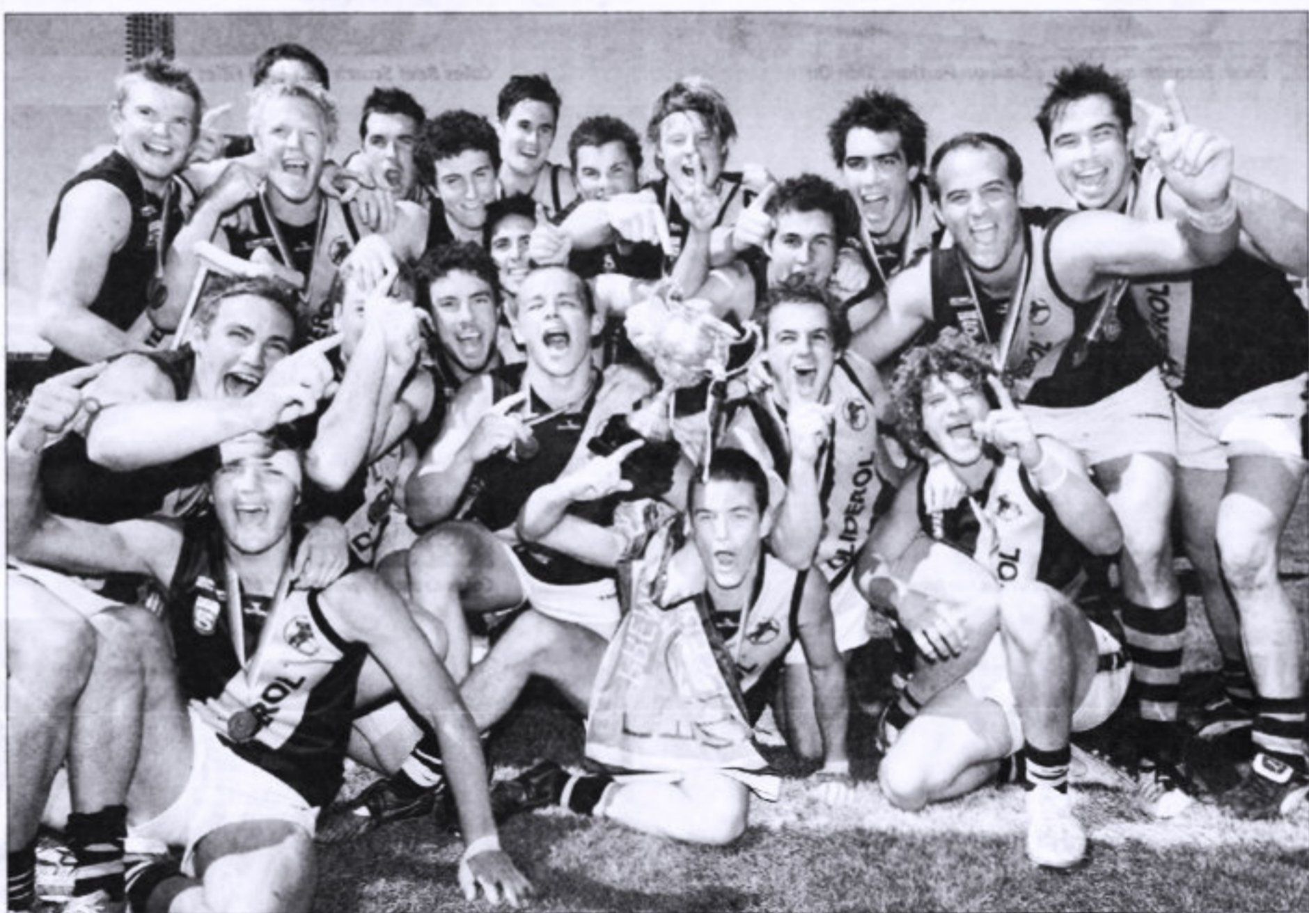
TOO GOOD: Glenelg went from fourth place to the Reserves Grand Final, then came from 41 points down to beat Woodville-West Torrens on Sunday.

Glenelg jumped the Eagles early, scoring the first two goals, but the majority of the first half was on the Eagles' terms before the margin blew out to 41 points early in the third, the Bays desperately needing to lift.