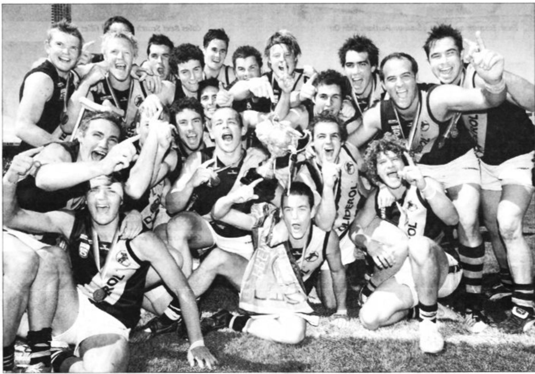
TOO GOOD: Glenelg went from fourth place to the Reserves Grand Final, then came from 41 points down to beat Woodville-West Torrens on Sunday.

Glenelg jumped the Eagles early, scoring the first two goals, but the majority of the first half was on the Eagles' terms before the margin blew out to 41 points early in the third, the Bays desperately needing to lift.