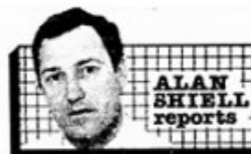
ALAN SHIELL reports

Glenelg amassed the highest score of the season in crushing bottom team Sturt by 132 points in the early match at Football Park yesterday.