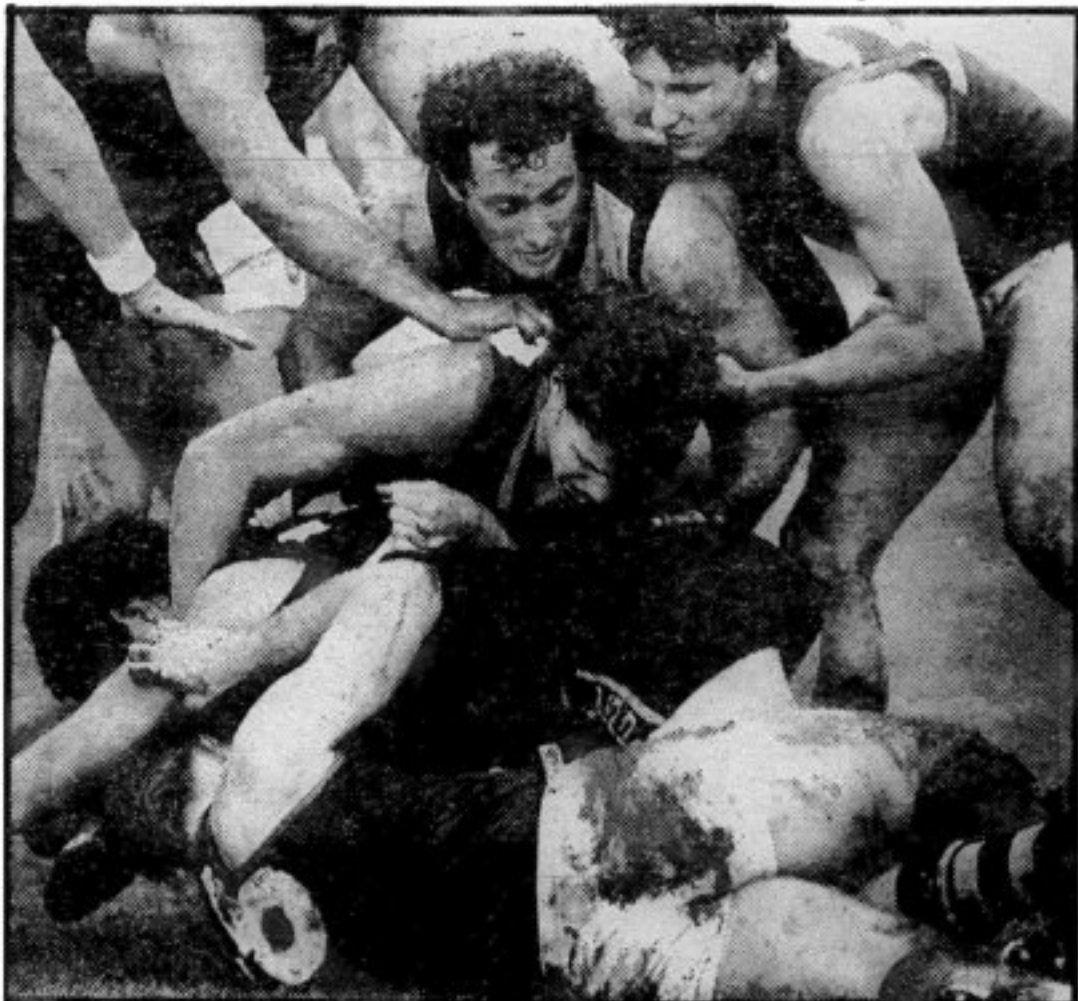
Everybody grabs a slice of the action at the Bay yesterday

"It was a desperation game for both teams. Our workrate and the contribution from every player was just that little bit better. But I had an enormous amount of respect for Norwood's performance, given the difficulties they had ..."