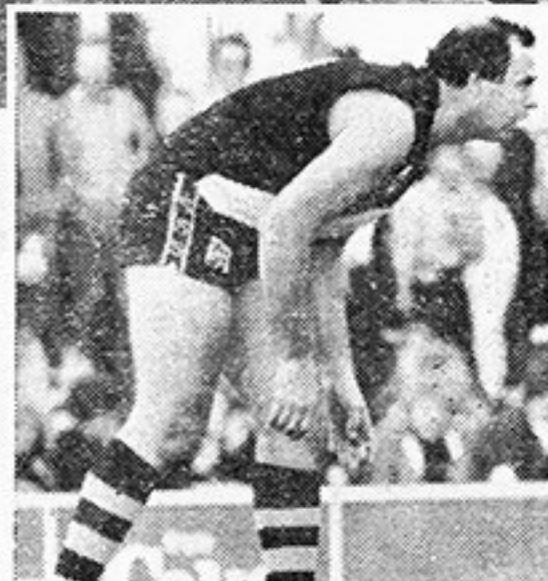
RIGHT: Preparing to take the first bounce.