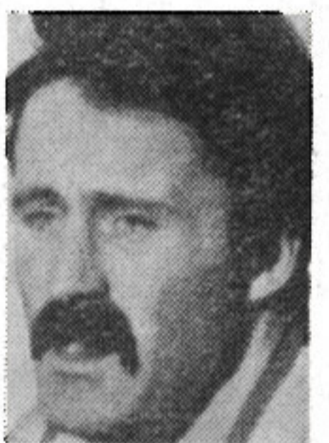
Copping: Good news.

But, as Cornes said, the Bays are running out of time.