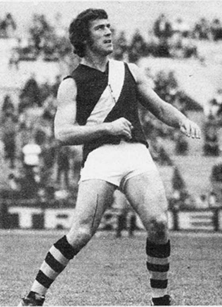
● Another goal.